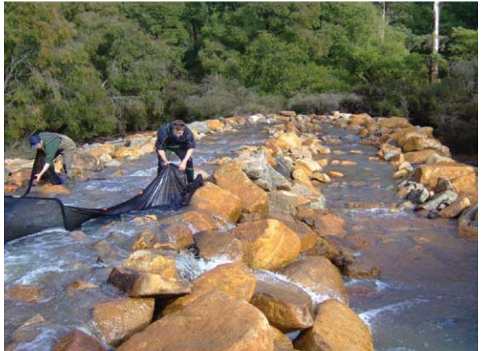
The rock fish-way at Barrett Street Weir allows fish migration in the Margaret River