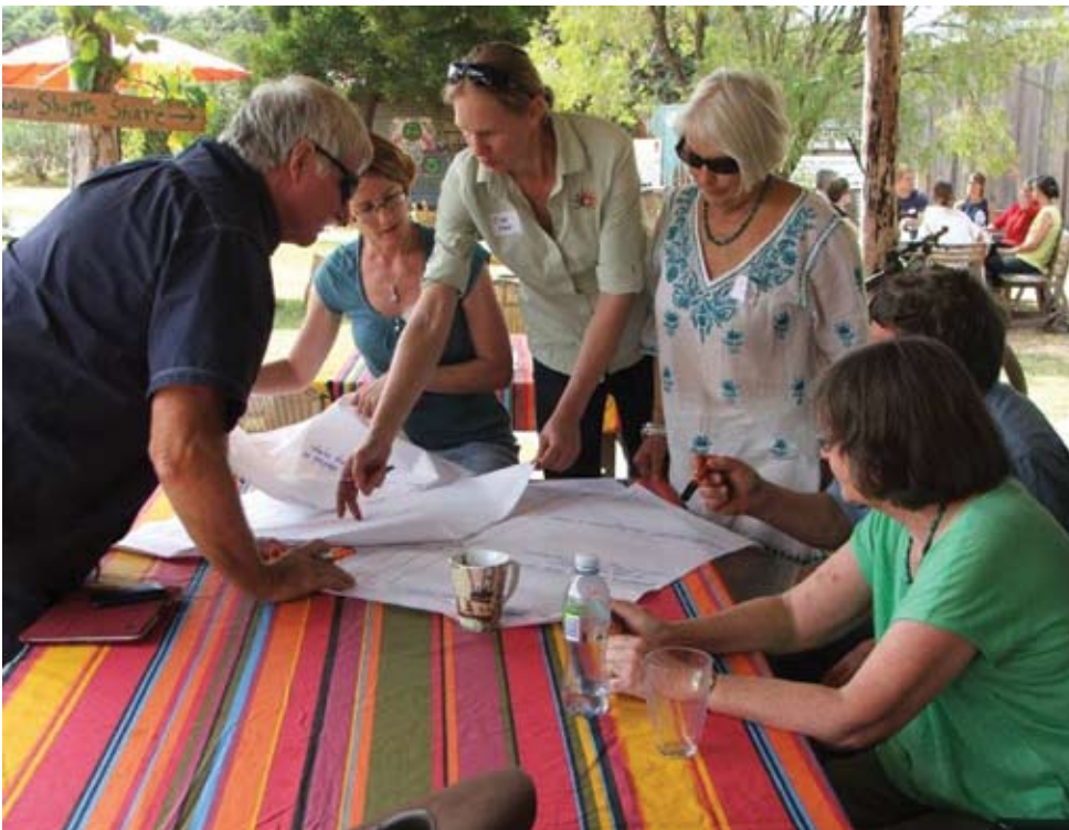
Consulting our stakeholders on the future directions for CCG at our 2014 annual community celebration

Over the years CCG has received funding and support to work on projects that protect our special region from State and Federal grants programs, the Shire of Augusta Margaret River, City of Busselton, Lotterywest and South West Catchments Council (SWCC). Our community and local businesses are also key supporters, donating money, time and services for schools programs, events and on-ground projects.